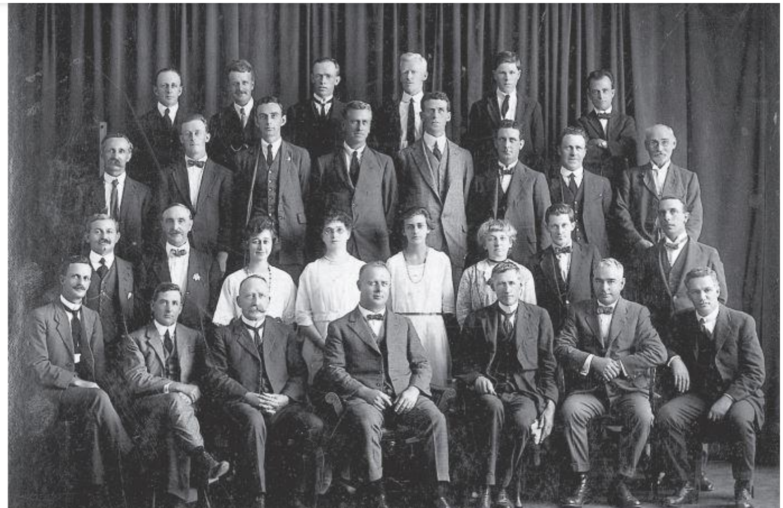
QUEENSLAND IRRIGATION COMMISSION HEADQUARTERS STAFF

"Commissioner"—The Commissioner of Irrigation appointed under this Act;